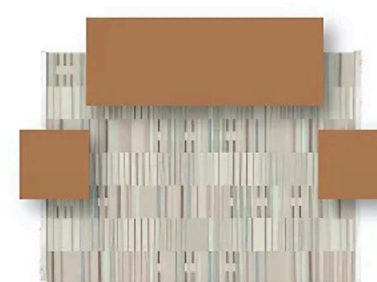
OSBORNE SINGLE BASE SOFA 2840MM